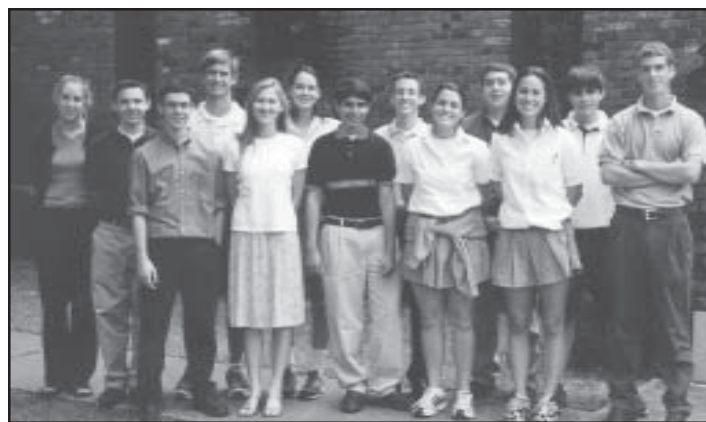
Episcopal's semifinalists and commended scholars

The National Merit Semifinalists join approximately 15,500 academically talented high school seniors in qualifying for this honor. As semifinalists, the students will have the opportunity to compete for about 7,600 merit scholarships worth approximately $28 million. Before they can be considered for merit scholarship awards, semifinalists must advance to the finalist level of competition by fulfilling additional requirements, which include having an outstanding academic record and submitting SAT scores that confirm the student's earlier PSAT/NMSQT performance.