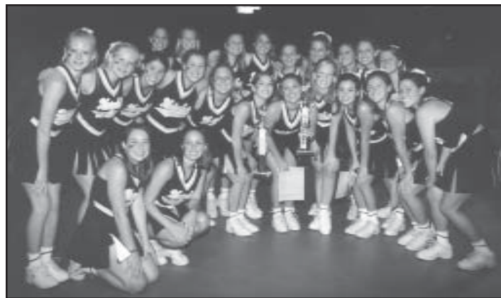
The varsity cheerleaders pose with their camp awards.