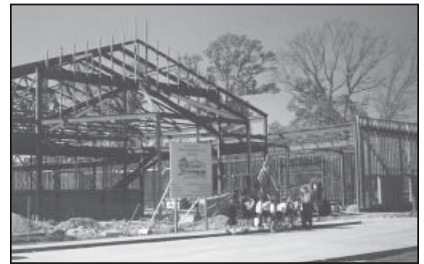
Top: The floor plan of the Visual and Performing Arts Center. Above left and above right: two stages in the construction of the VPAC. Right: Workers prepare to tear down the rectory, which was located in the spot where the VPAC now stands. The offices that had been housed in the rectory are now located in the Alumni House, which opened in the fall of 2000.