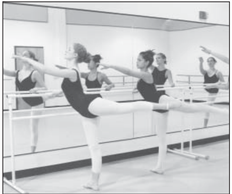
Dancers practice during ballet class. The dance studio in the new building has allowed the addition of dance courses.

The size of the building provided a challenge for the architectural firm of Bodman, Webb, Noland & Guidroz, which planned a design that would reflect the feel of Episcopal's campus. For example, a col-