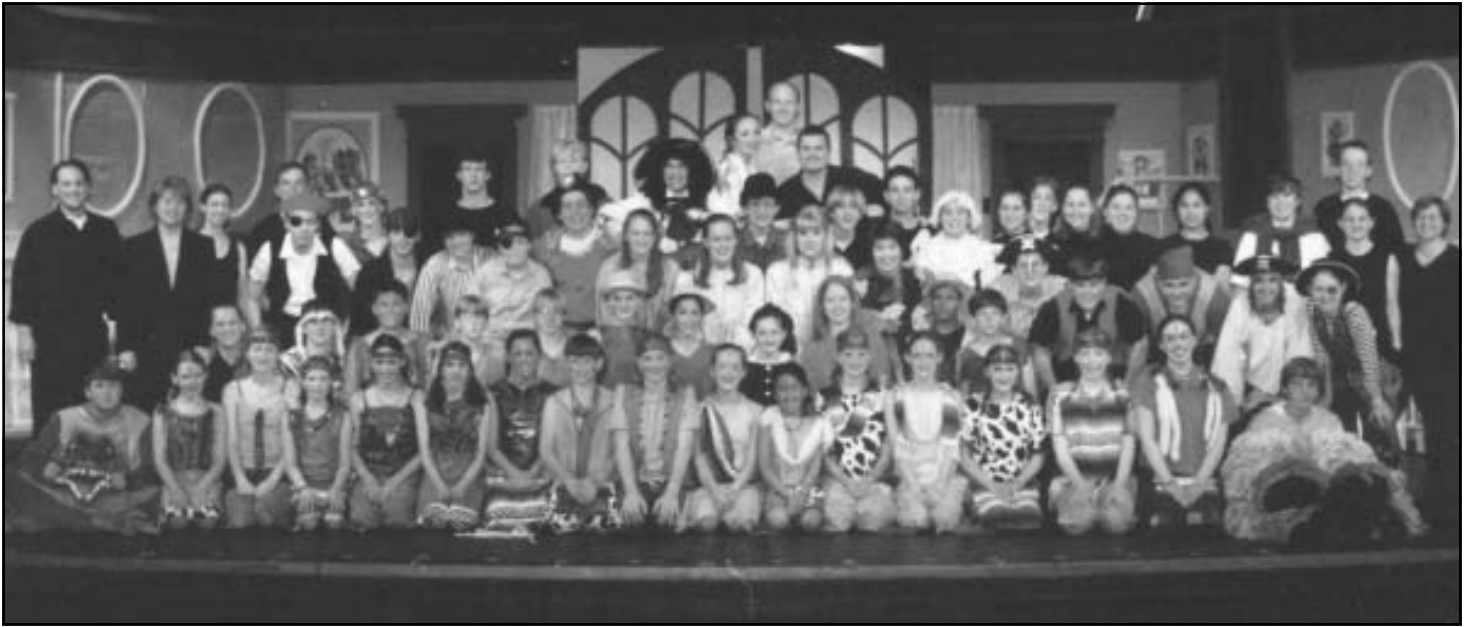
Above: The cast and crew of "Peter Pan," Episcopal's first all-school musical in the new Visual and Performing Arts Center.