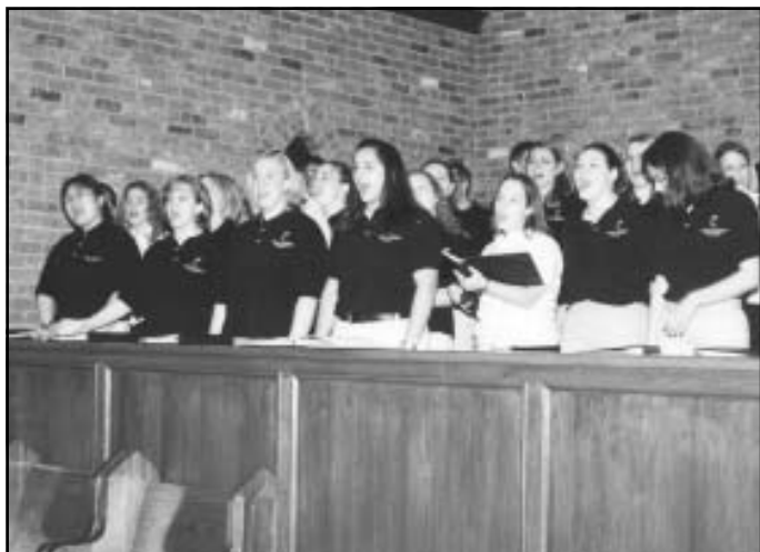
Episcopal's Treble Choir rehearses along with the University of Cincinnati Men's and Women's Choruses.