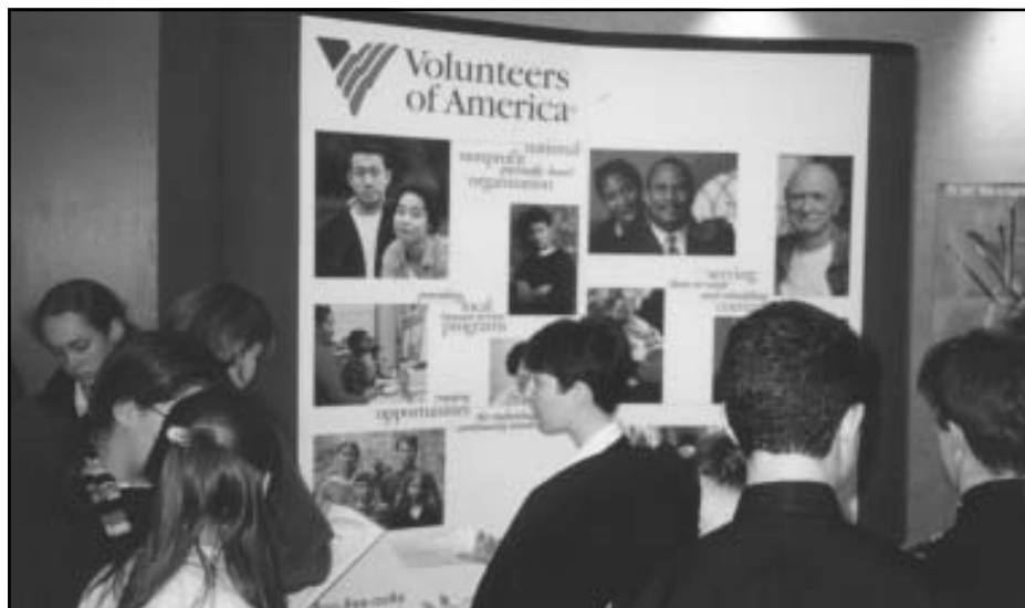
Upper School students check out one of the displays set up during the Community Service Fair in January.

The Episcopal Board of Trustees annually awards scholarships on the basis of academic merit to students entering ninth grade. Students applying must have at least a 3.5 grade point average in an academically challenging curriculum. The awards are renewable for the remainder of the student's high school career at Episcopal as long as the student maintains satisfactory standards of citizenship and academic performance.