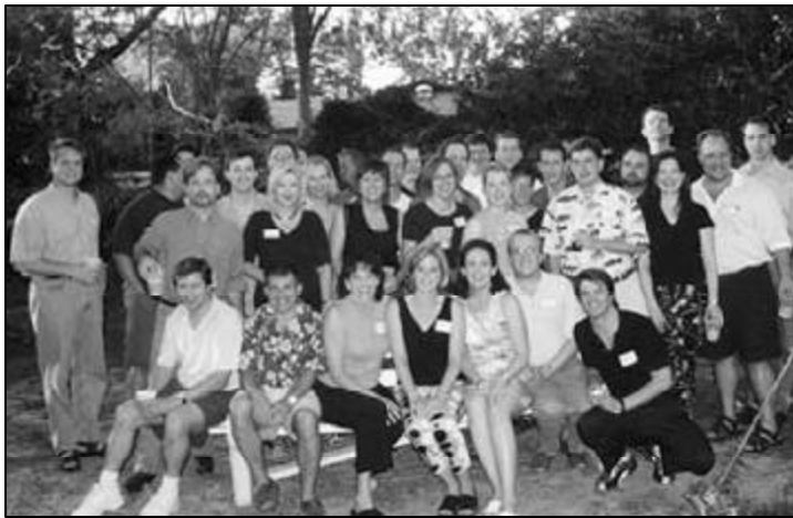
The class of '82 gathers for its reunion the weekend of June 15. The class had a crawfish boil and a picnic lunch at Episcopal.