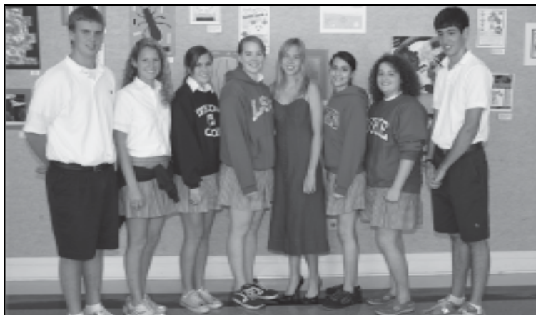
Episcopal's National Merit honorees (Three not pictured)

Twenty-three of the new students are children of alumni, and 34 new students are siblings of current students. The school also welcomed new families from as far away as Scotland, Cambodia, England, Japan and Germany.