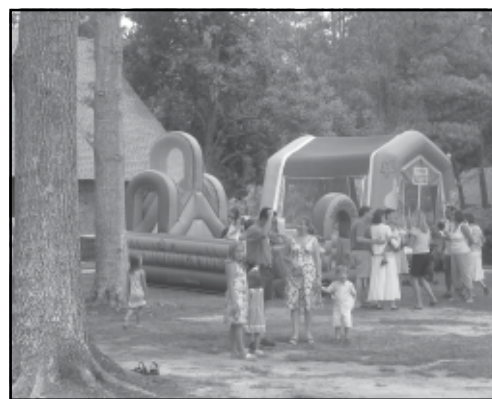
Children enjoyed playing on giant inflatables at the reunion.