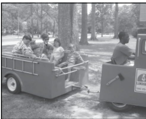
Fire engine rides were one of the highlights of the reunion picnic for the children.