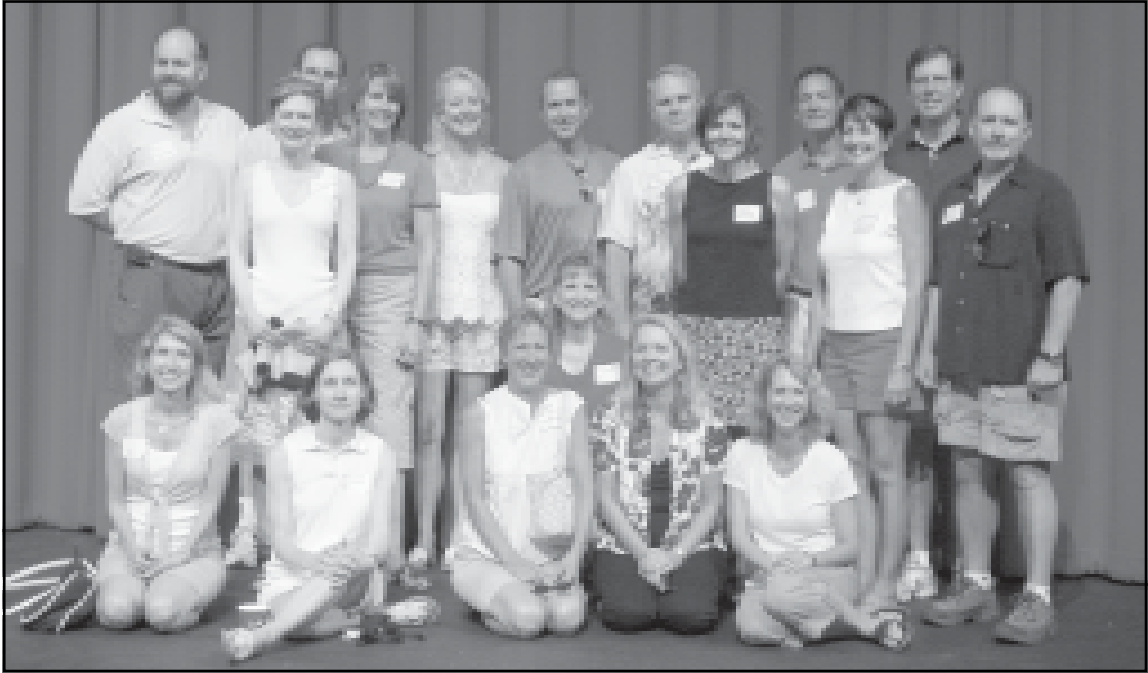
The classes of 1976 and 1996 held their reunions the weekend of July 8, with a Saturday picnic at Episcopal for both classes. At left, members of the class of 1976 pose for a photo on the Visual and Performing Arts Center Main Stage.